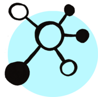
Diagram created with MindGenius