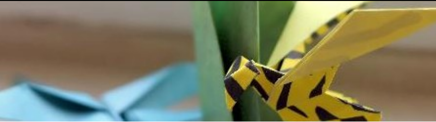
"Origami" by Jack Lyons (CC by-nc-nd 2.0)