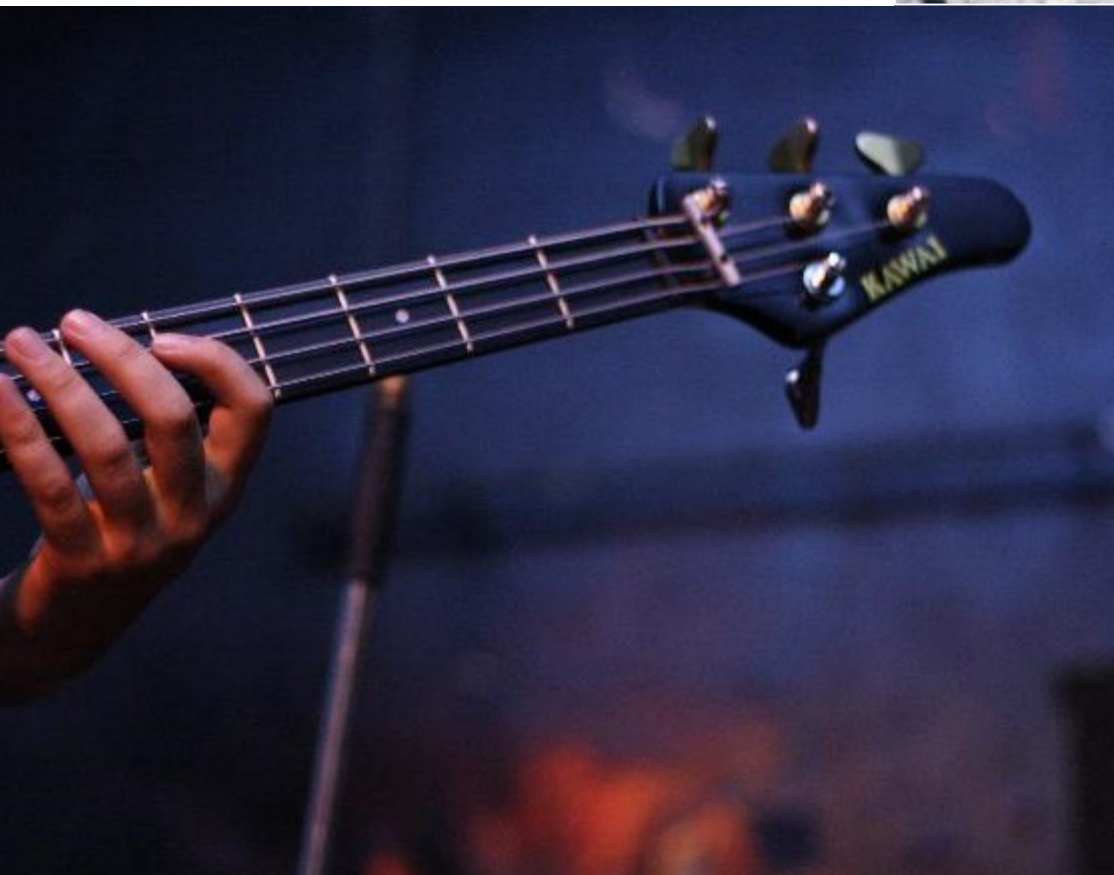
"Instiga @ Hammer 28/nov" by Eduardo Otubo (CC by 2.0)