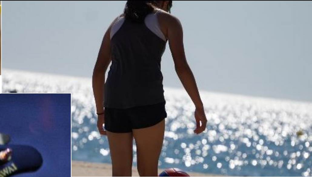
"DSC04205" by TheKilens (CC by-nc-nd 2.0)