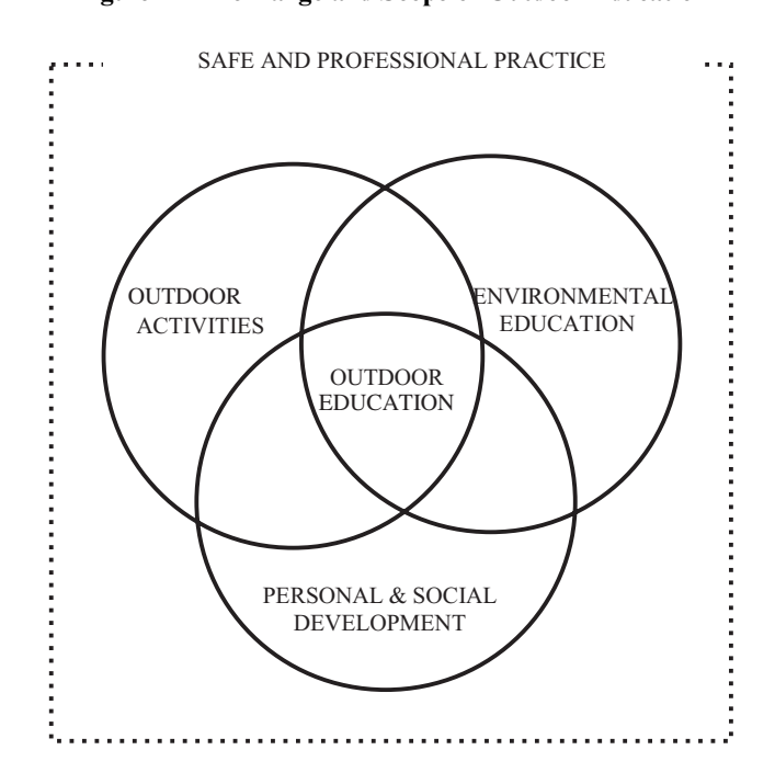
Figure 1—The Range and Scope of Outdoor Education

We are committed to a broad vision of learning outdoors as the corollary to learning indoors. In this context the outdoors offers a multitude of sensory, aesthetic, intellectual, physical, intellectual, personal, social and spiritual opportunities which can be approached in an interdisciplinary way which is very difficult to achieve in the classroom. Direct experiences of the outdoors bring us into contact with our culture and heritage, have implications for health and well-being through physical activity and personal and social development, and often take place in settings where environmental and sustainability education can be offered in a way which would be impossible in a classroom. To this end we have developed the three circles model shown in the figure below. In this context the role of the outdoor educator is seen as someone who facilitates learning in each, or all three, of the circles according to the needs of the individuals they teach and the requirements of the curriculum. A fully competent outdoor educator will feel confident to work in all three circles whilst always adhering to safe and professional practice.